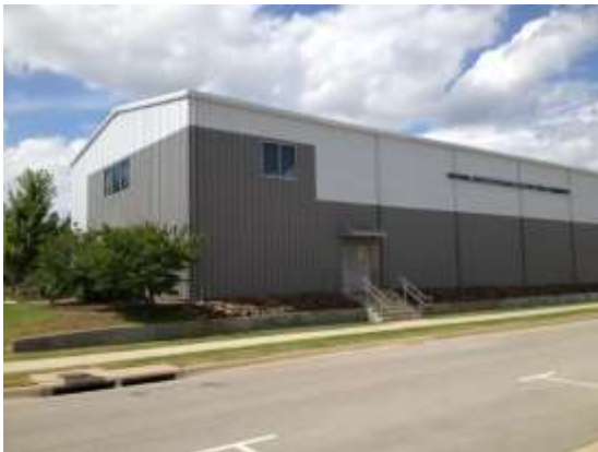
NCREPT (National Center for Reliable Electric Power Transmission).

GRAPES-UA facilities include the HIDEC (High Density Electronics Center), a developer of award-winning high-voltage and high-amperage power electronic modules, and NCREPT (National Center for Reliable Electric Power Transmission), a 7000-square foot, $5M, national-caliber power electronic test facility with three 2-MVA distribution-level test circuits. This medium-voltage test facility is capable of 3-phase test circuit regeneration at the 2-MVA level at 480 V, 4.16 kV and 13.8 kV.