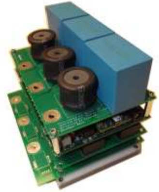
Dense Power Electronic Interfaces project prototype.

The main objectives of this research are to develop indirect matrix converters (IMCs) that are reliable and have high power density to interconnect DG and which require ac-ac conversion or dc-ac conversion with a high-frequency stage. After the development of the SiC-based IMC prototype, another goal of this research is to investigate the viability of using the boosting operation of the IMC.