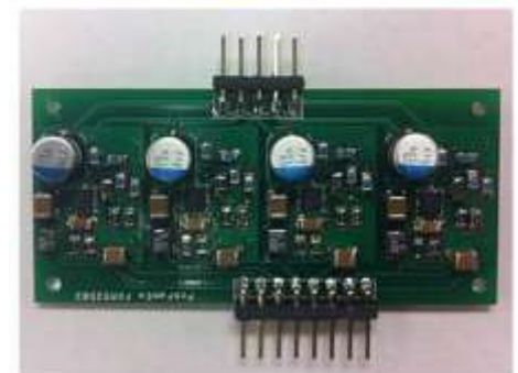
Optically isolated gate driver for wide bandgap high-speed devices.