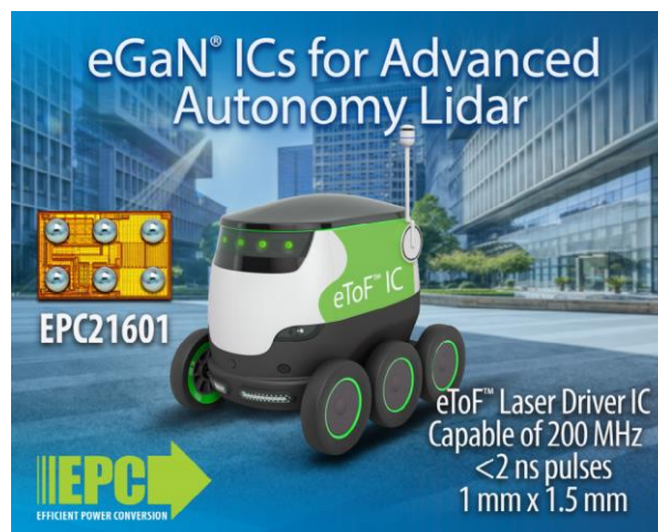
Fig. 3. The EPC21601 is the first member of a new GaN IC product family offering higher performance and smaller solution size for time-of-flight lidar applications including robotics, drones, 3D sensing, and autonomous cars. According to the vendor, this laser driver IC will extend the use of lidar into many new applications.