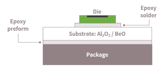
Fig. 3. A thermal spreading model is used to predict the junction-to-case temperature rise for each of the semiconductor devices in the hybrid assembly.