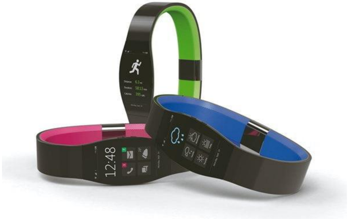
Fig. 2. With the nPM1100, Nordic will help its present and future customers to not only wirelessly connect their devices to the Cloud but also power and charge those same devices. The PMIC is designed to be as compact as possible to meet the space constraints of tiny IoT devices. Examples include remote controls, wearables, personal medical devices and portable sensors; these are the types of products where the designer is required to equip the device with a lot of functionality while keeping the product dimensions small.