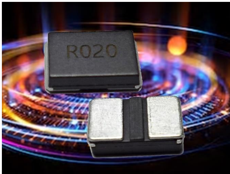
Fig. 1. The HCSM2818 series of high-power metal-element current shunt resistors features a 5-W power rating in a small 2818 chip size and excellent long-term stability. The parts are 100% RoHS compliant and lead free without exemption, halogen free, AEC-Q200 compliant and REACH compliant.

Pricing for the HCSM2818 varies with tolerance and ranges from $0.40 each for 5% to $0.45 for 1% tolerances. Contact Stackpole or one of the company's franchised distributor partners for volume pricing. For more information, call 919-850-9500, email marketing@seielect.com or visit the website .