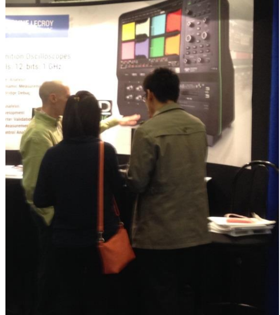
Visitors to Teledyne LeCroy's booth at last year's ECCE learn about the MDA810 Motor Drive Analyzer.

Another test company, <u>Keysight Technologies</u> (booth #527), plans to show a broad range of instruments that aid designers in the selection of the right power components. Some key products include Keysight EEsof Electronic Design Automation (EDA) Software for accurate design simulation & modeling, power device analyzers, oscilloscopes, power electronic simulators,