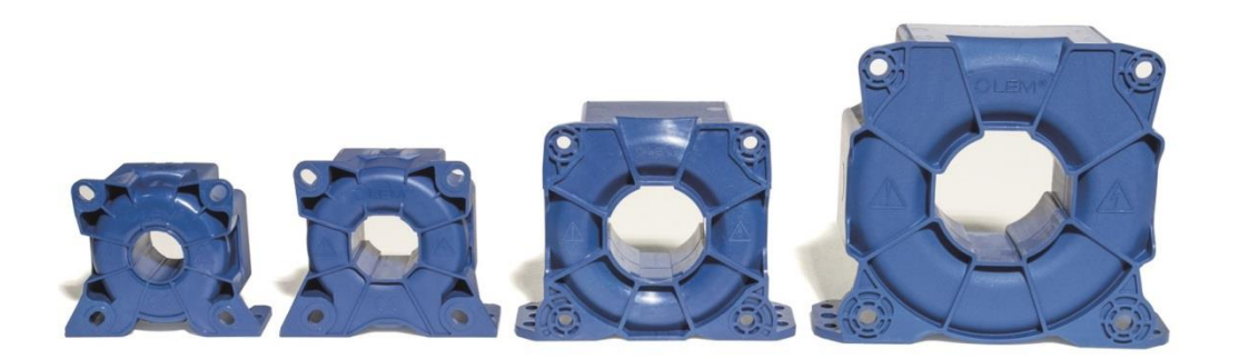
LF xx10 transducers for non-intrusive and isolated nominal measurements of dc , ac and pulsed currents.

<u>Proto Laminations</u> (booth 420) specializes in the manufacture of electrical laminations in short runs supporting the research and development, prototype evaluation and limited production needs of motor and generator producers worldwide. In its exhibit, Proto Laminations will be highlighting its short-run manufacturing expertise pertaining to electrical laminations and will be making special note of the company's design-formanufacturability and materials engineering services. As in past years, Steve Sprague will be on hand to discuss in detail the company's capabilities.