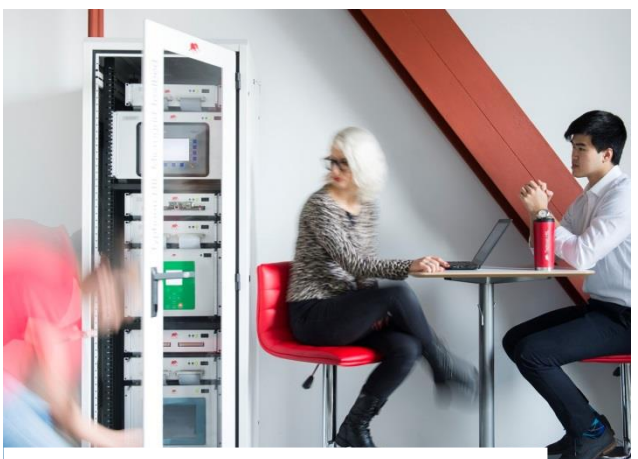
Typhoon HIL Microgrid Testbed.

Attendees can stop by <u>Powersim</u>'s exhibit (booth #504) to learn more about PSIM, and its add-on modules. PSIM is Powersim's core power electronics simulation tool, which empowers engineers to accelerate the pace of innovation with what the company describes as the fastest, most reliable and easy-to-use solution. PSIM provides expert technical support and delivers systems-level solutions that integrate smoothly with other popular engineering platforms.