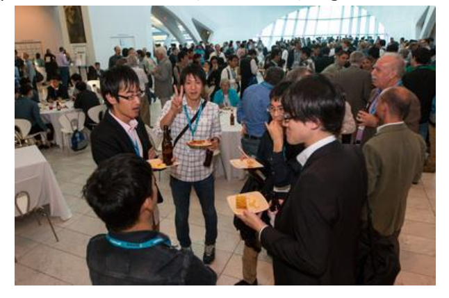
Conference goers enjoy ECCE 2016's opening reception at the Milwaukee Art Museum.

While this event was just for the conference planners and organizers, earlier that day attendees were able to take factory tours of the