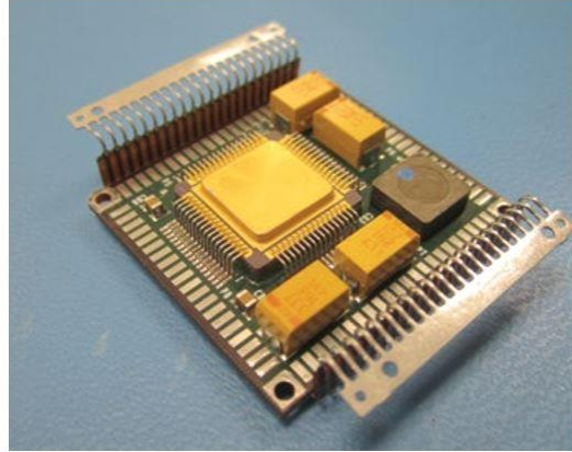
BAE Systems' RAD POLX-14P/S converters.

Both the RAD POLX-14P and RAD POLX-14S converters are fully integrated building blocks for today's digital space electronic modules. They minimize non-recurring engineering and maximize space and routing channels for other electronic devices on the hosting motherboard module. These products enable efficient processing to meet the onboard requirements of the spacecraft environment. Integrated power switches, magnetics, and stable power enables controlled circuitry.