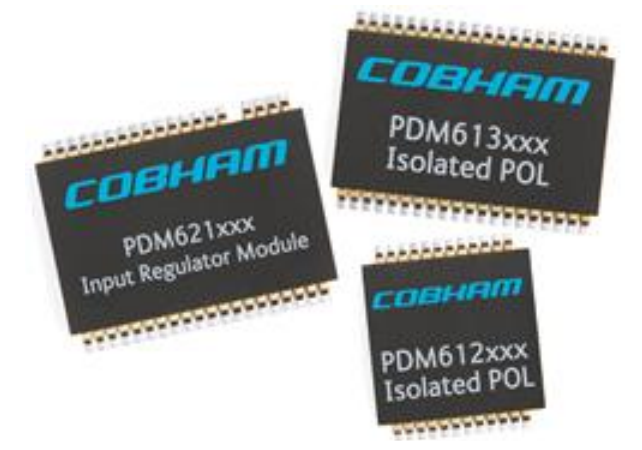
Cobham's rad hard Power Distribution Modules.

These modules are also radiation hardened to meet TID immunity of 50 krad(Si) and SEL immunity up to 80 MeV-cm²/mg. The PDMs are a family of input regulator modules (IRMs) and isolated point-of-load modules (iPOLs) that together make up a power conversion system. The IRM provides a regulated intermediate voltage to the iPOL which can be set to adjust to load condition by using the adaptive loop feature between the IRM and iPOL. The iPOLs are isolated, unregulated, dc-dc converters that divide down the intermediate bus voltage, provided by the IRM, by a constant k-factor. These PDMs can generate an adjustable output voltage as low as 0.65 V to meet the core voltage requirements of the latest FPGAs and ASICs.