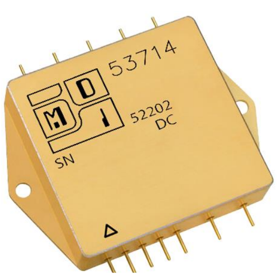
Modular Devices' rad-hard 3714 series 18-W triple-output sequenced hybrid converter.

Finally, the Intersil booth will feature rad-tolerant plastic parts for mega-constellation satellites. Intersil will provide static evaluation board demos of two of its soon-to-be-released plastic packaged radiation tolerant ICs, including a low-power 40-V quad precision RRIO operational amplifier, and a 6-A synchronous POL buck regulator with integrated MOSFETs.