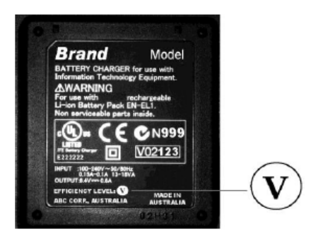
Fig. 5. Energy efficiency level marking.

"Efficiency Level" shown in the example below is optional.